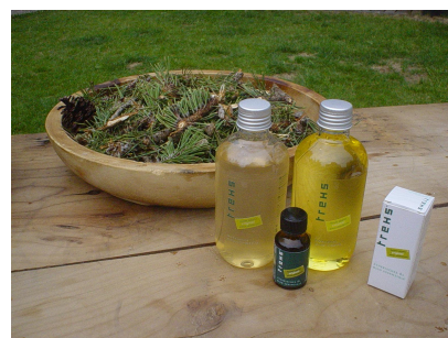
Certified essential oils