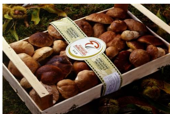
Certified porcini mushroom