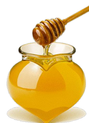
Certified forest honey