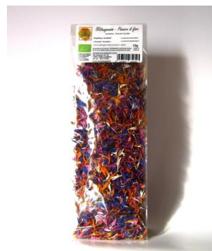
Herbs and aromatic species